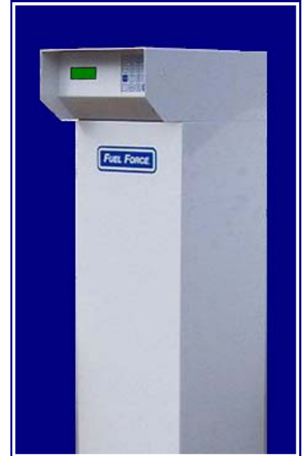
FUELFORCE FUEL MANAGEMENT SYSTEMS

Control all aspects of security including access to fueling sites, access to island terminals, access to sensitive data, and authorization for issuing fuel. Authorize fuel only to valid vehicles by valid drivers, all in a timely and efficient manner.