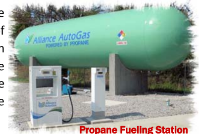
Propane Fueling Station

This is part of Multiforce's continuing leadership role in the Alternative Fuel Vehicle infrastructure market. Multiforce has provided nearly all of the controllers for compressed natural gas (CNG) sites installed by Clean Energy for the past decade and also partnered with UFuel, Inc. to provide E85 and Biodiesel fueling stations across the country using the FuelForce EXACTA fuel controller. To learn more about our offerings for alternative fuels, see pages 3 & 4, or contact us at 609-683-4242 Extension 111.