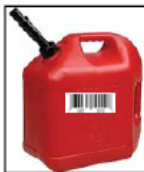
Barcode Systems Available for Mobile Units

Tanker will require valve, meter, pumping unit, hose, and nozzle.