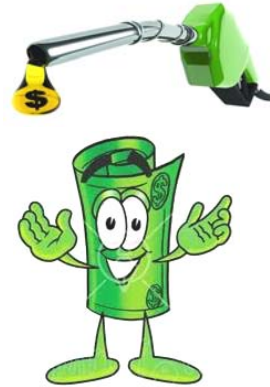
FUELFORCE Saves You Money!