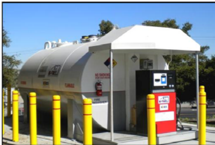
FuelForce Portable Vending System

FuelForce has partnered with UFuel, Inc. to provide a complete tank, pump, and fuel management system on a portable skid.