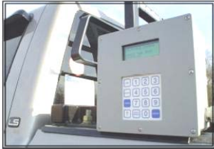
Mobile Tanker Unit

Monitor fueling for your field mobile tanker trucks. Find out where your fuel is going.