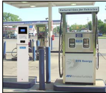
FF814 Card Reader Controller at Retail DTE CNG sites. Credit Cards and Receipts.

Detroit Energy (DTE) has been a great customer for FuelForce with over 50 Fleet sites being monitored by FuelForce systems.