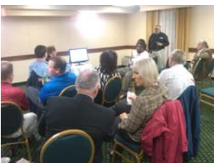
Distributor Appreciation Event

Also, thanks to all who came to our Distributor Appreciation event at the Courtyard Marriott where we had a demonstration of our FuelServe.Net Hosting Service. FuelServe.Net is a fantastic service that you can offer your customers!