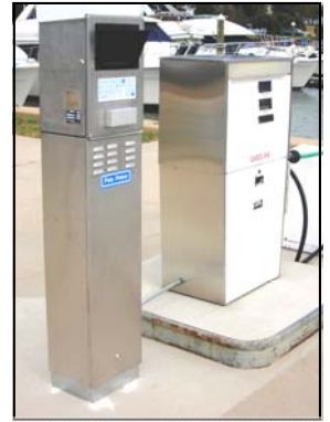
Offer your customers 24 hour fueling while eliminating motor-off's and cash theft.

Upgrade your site for the upcoming season !