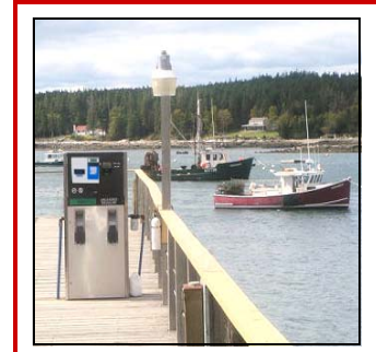
Marinas - Credit Cards, House Accounts, and Cash Sales