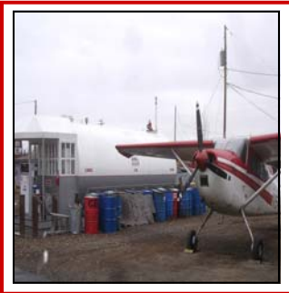
Small Airports - Credit Cards, House Accounts, and Cash Sales