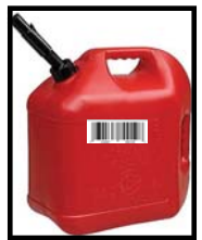
Any Container Can Have A Tag