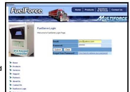
FuelServe login on secure FuelForce website.