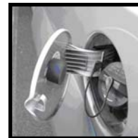
Low Cost Proximity Tag