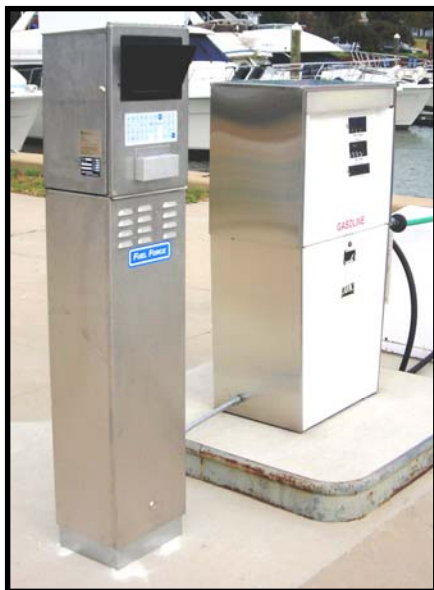
Stainless Steel 814 Controller

If you have a fueling site in an area where there is a lot of dust and dirt or salt air, look into the Stainless Steel Option for the 814 controller now!