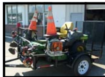
Any Equipment That Can Be Fueled On Site Can Be Tagged And Fuel Loss Eliminated.