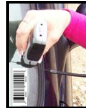
Low Cost Barcode Tag