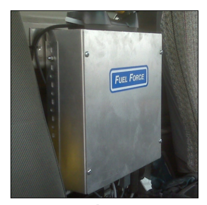
Site Control Proccessor

The FuelForce Mobile Tanker Truck Control Unit consists of 2 main components, a site control processor, mounted into the cab, and the input terminal which is mounted on the chassis. The FuelForce Unit, when all Truck Preparation Modifications are completed, will provide the electronic authorization and recording for 1 or 2 hoses.